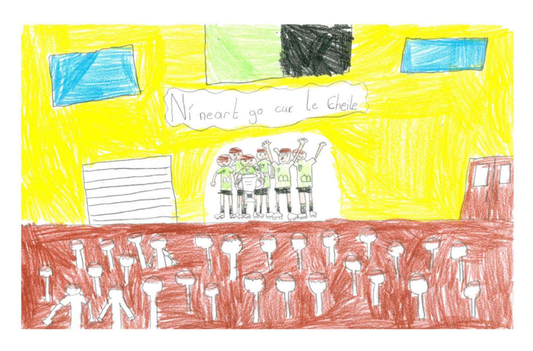
At St. Patrick's Boys' National School Ní neart go cur le Chéile.